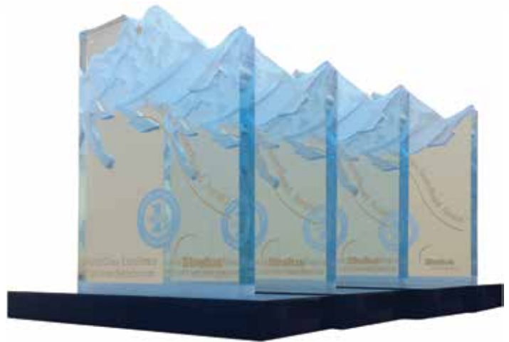
4x Northface Scoreboard Award Winner for exemplary customer service